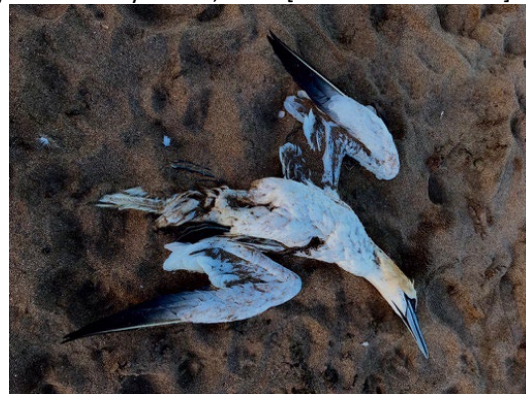
Below: Corpse of a gannet from the Bass Rock colony on a nearby beach, 2022 [Patricia Macdonald].

The 2021-22 pandemic of ‘bird flu’ or Highly Pathogenic Avian Influenza (HPAI – another lethal pandemic acronym to remember alongside Covid-19), is an unprecedented, largely anthropogenic, globalised threat that is bringing about the deaths of enormous numbers of the familiar seabirds nesting this summer on coasts and offshore islands. HPAI outbreaks regularly occur in the winter months in Europe, but never before have we seen a peak of cases during summer. Seabirds have been unaffected in previous outbreaks.