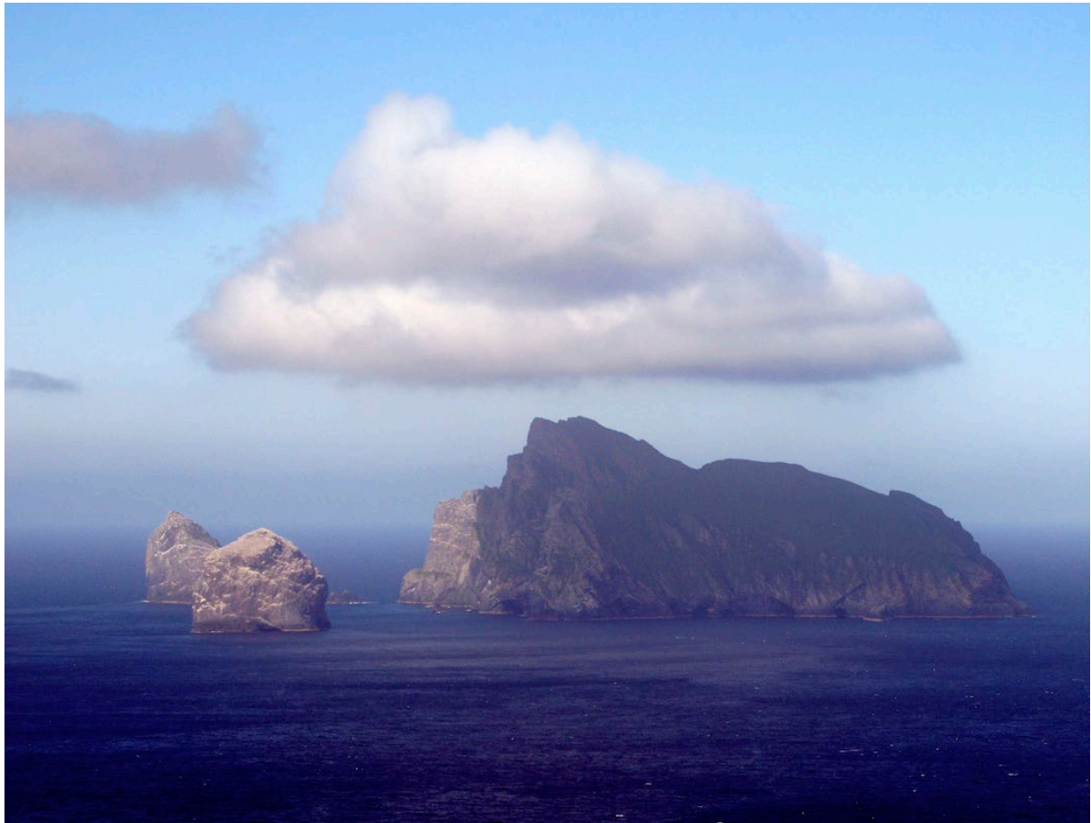
Boreray and the stacs from above Hirta, St Kilda.

Forty years ago, great black backed gulls were active predators in the breeding season and generally, the skuas were feeding through klepto-parasitic activity. In 2019, it was clear that the gulls had declined in numbers, their territories were occupied by skuas and their feeding strategy was much more reliant on direct predation.