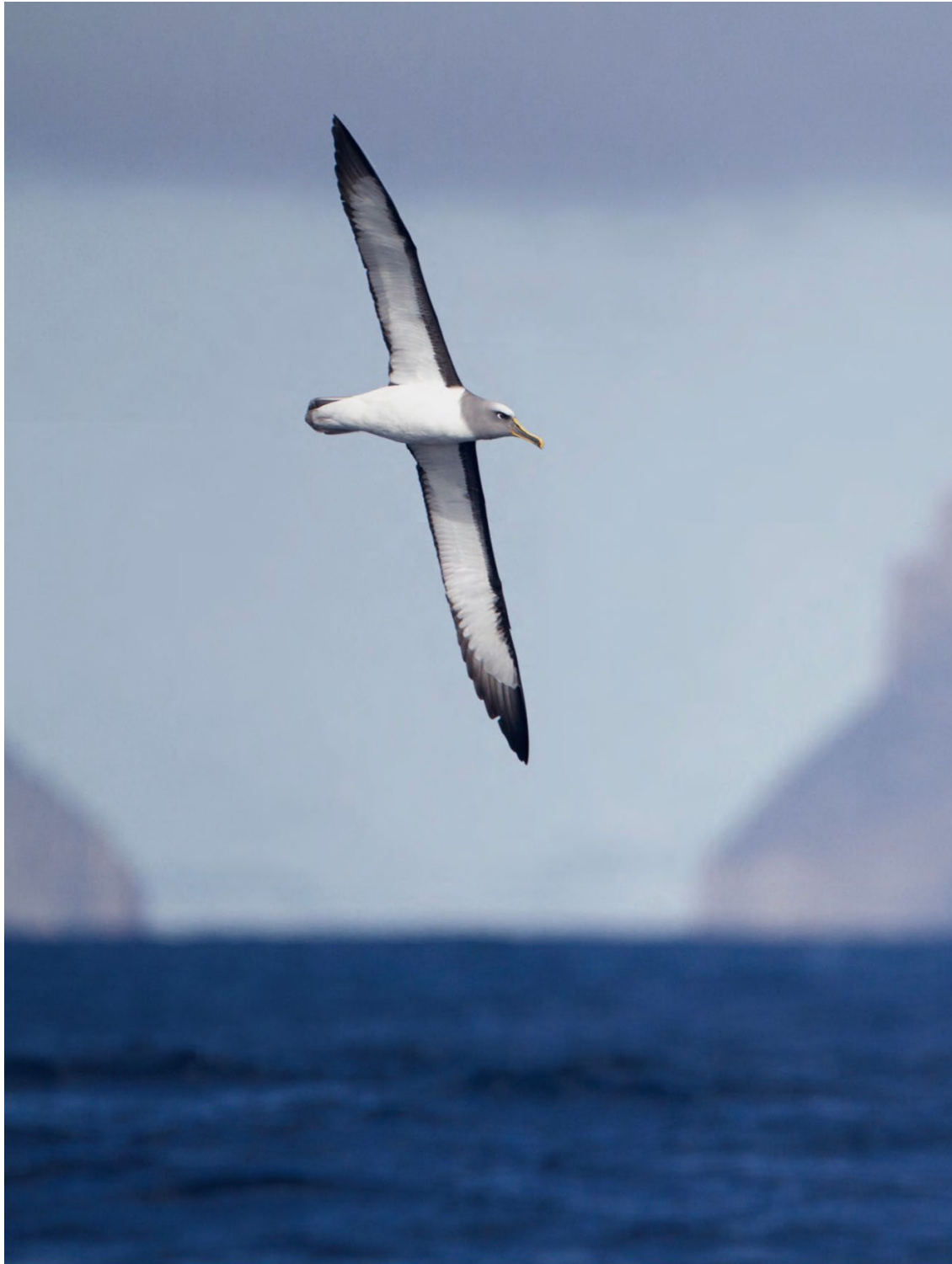
Buller's albatross at sea east of the Tasman Peninsula, Tasmania, Australia.

Your books give intensely empathetic glimpses into the realities and significance of the very different lives of a wonderful spectrum of creatures of sea and shore. You tell us how an albatross navigates its world; how a minute creature like a sand-hopper on the beach knows