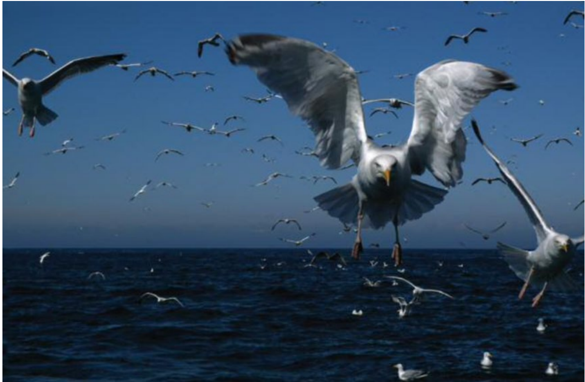
Above: Gannets in flight near the Bass Rock, Firth of Forth, Scotland