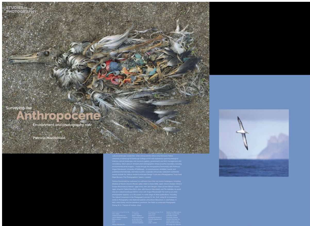
Surveying the Anthropocene: left: Front cover image ; right: back cover image.